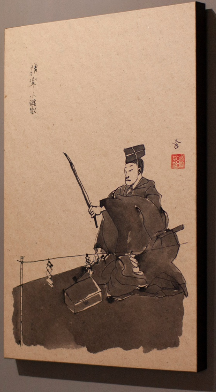
Noh Kokaji (from Kogyo Tsukioka) Set of two, 44 x 29cm, Ink on paper, 2024 Signed recto, Traditional mounted and black edged