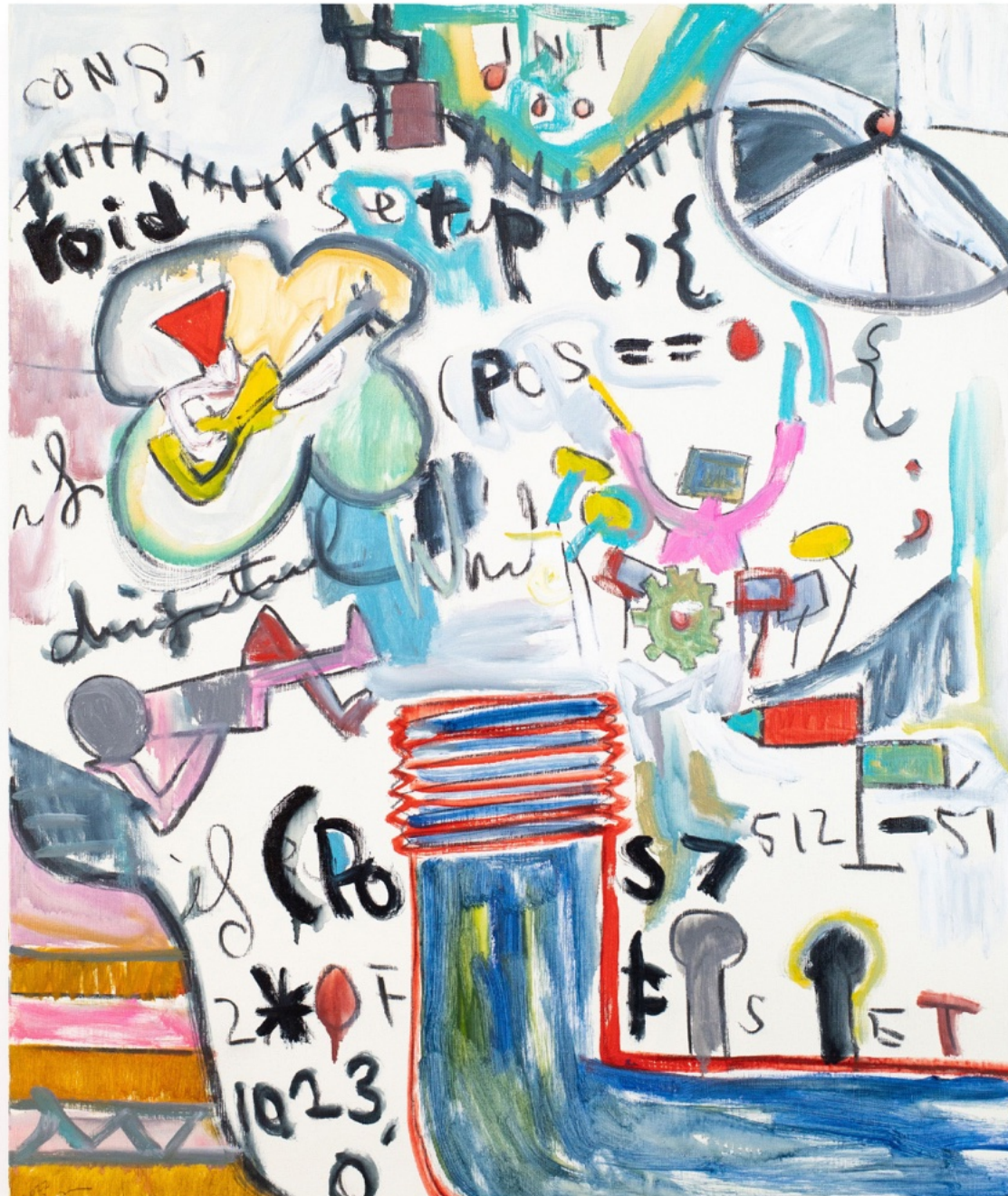
Jimi Hendrix and C script 73 x 60cm, Oil on canvas, 2022 Signed recto, Unframed