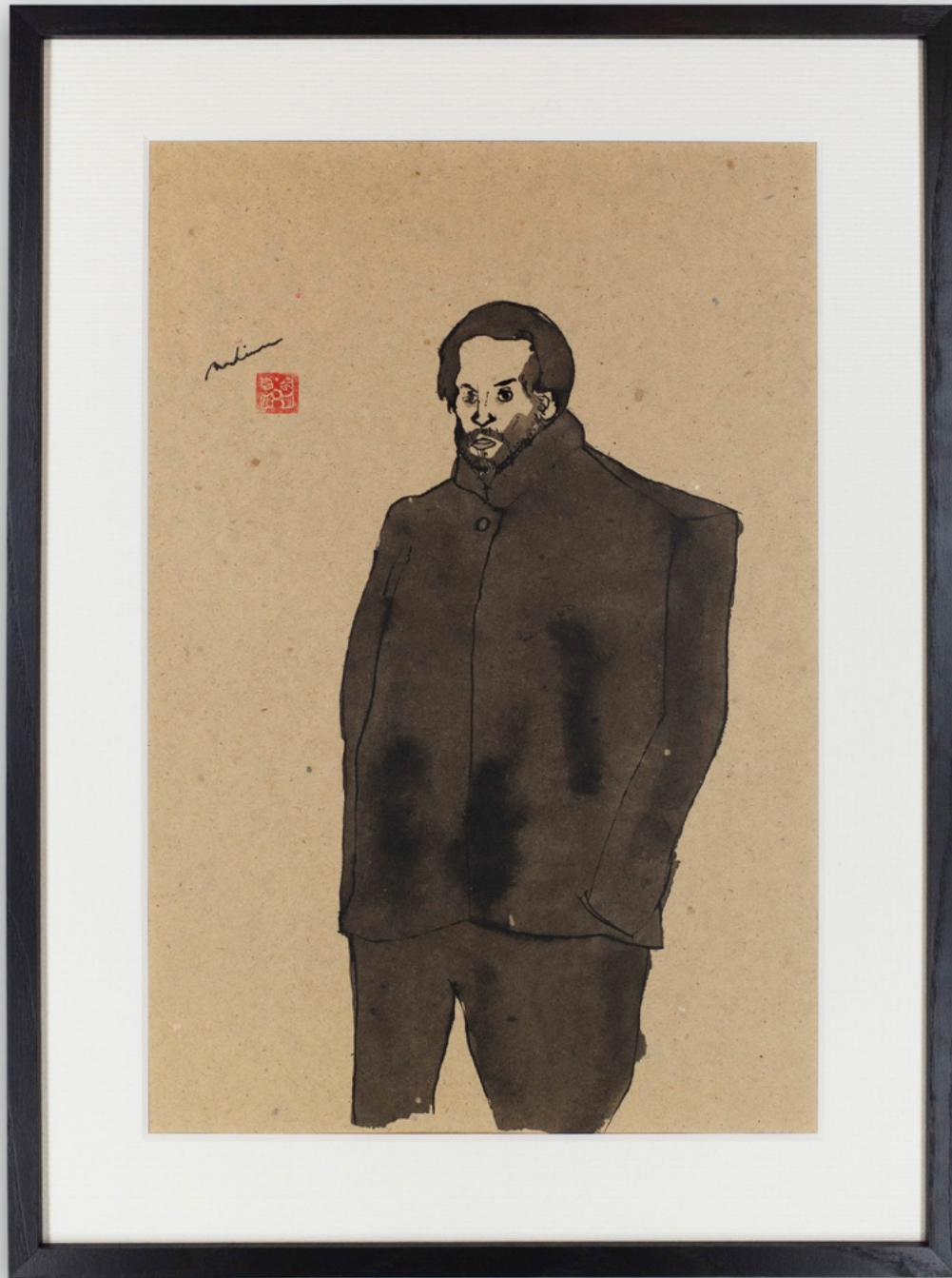
Self Portrait (from Pablo Picasso) 45 x 30cm, Ink on paper, 2024 Signed recto, Lined and Framed