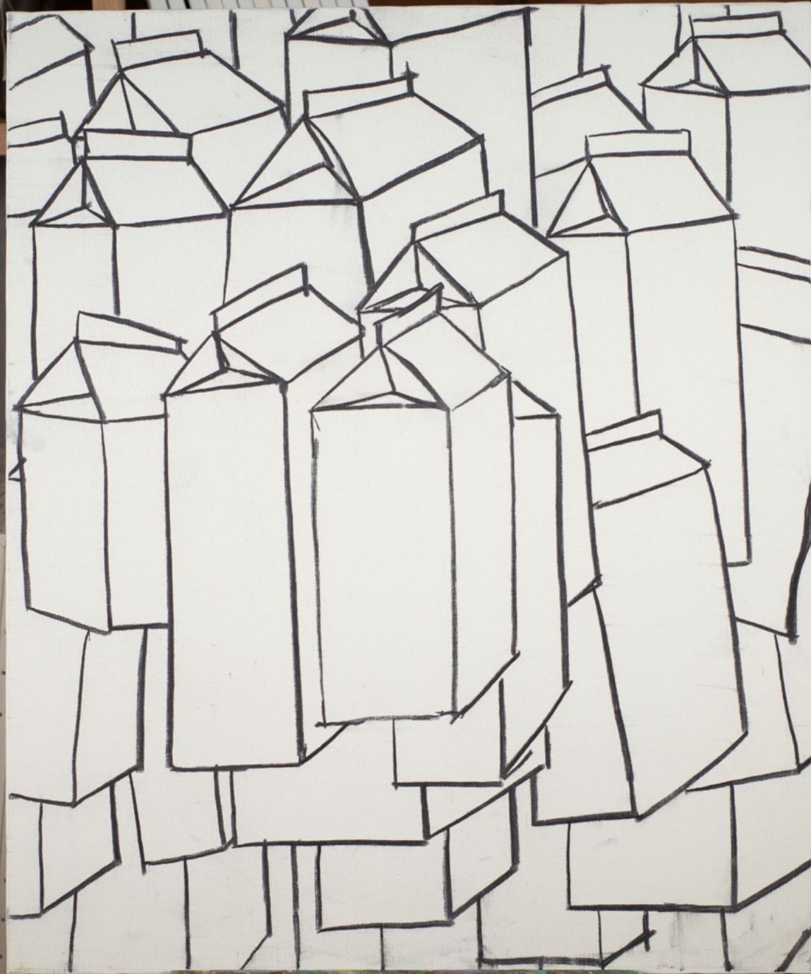
Milk Packs 73 x 60cm, Charcoal on canvas, 2022 Signed verso, Unframed